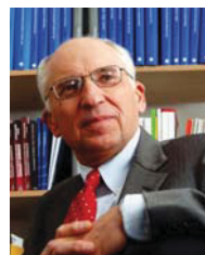
Konrad H. Jarausch

He is currently emeritus Professor of The Graduate Institute of NGO Studies, Kyung Hee University, and focuses his research on international ethics, and philosophy of language and culture.